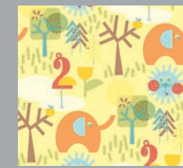
Jungle Friends Citrus