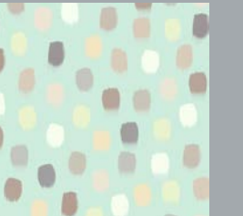
Spot On Vanilla Ice