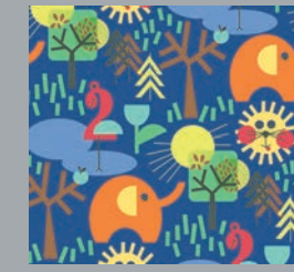
Jungle Friends Cobalt