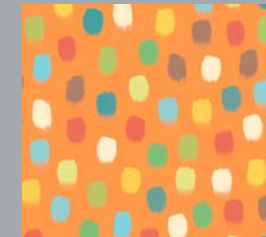
Spot On Citrus