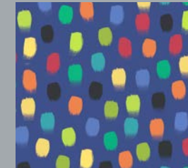
Spot On Cobalt