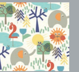
Jungle Friends Kingfisher