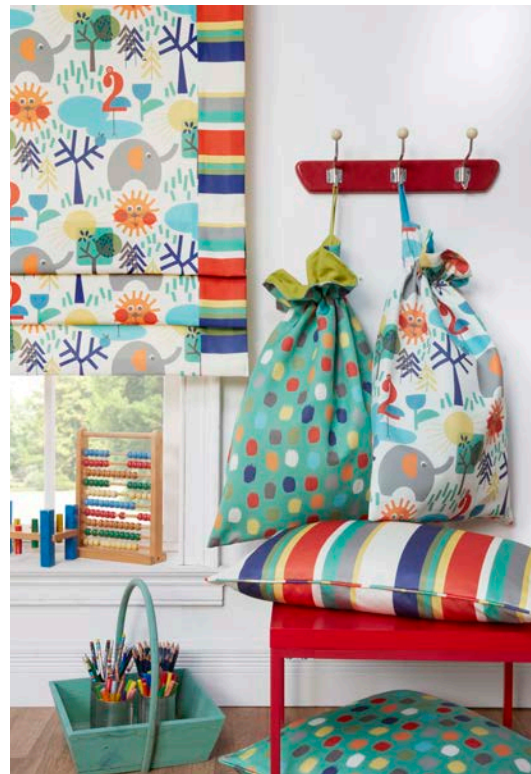
Blind: JUNGE FRIENDS Kingfisher / TIGHTROPE Kingfisher. Drawstring bag: SPOT ON Kingfisher, JUNGLE FRIENDS Kingfisher. Cushions: TIGHTROPE Kingfisher, SPOT ON Kingfisher.