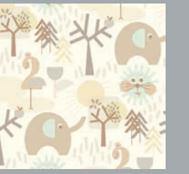
Jungle Friends Vanilla Ice