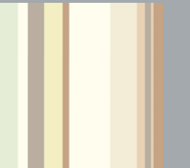
Tightrope Vanilla Ice