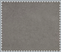
Dove Grey 514