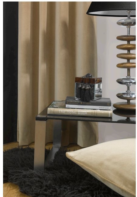
Cushion: REGENCY Beige / Black