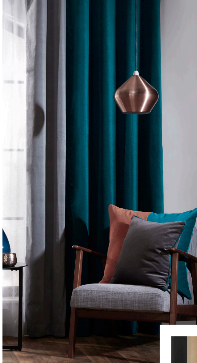
Curtain: REGENCY Peacock / Dove Grey, Sheer: MOMENTS Mist.