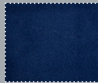
French Navy 330