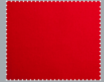
Cardinal Red 34