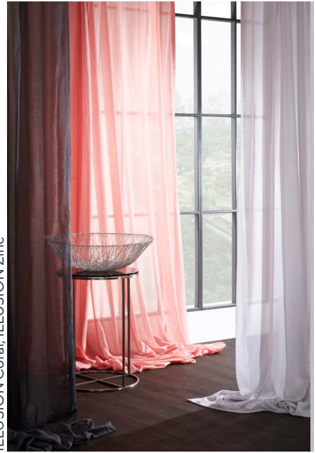
Curtains: ILLUSION Anthracite, ILLUSION Coral, ILLUSION Zinc